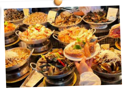
SEN 自助餐 SEN buffet