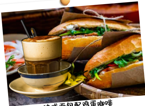
法式面包配鸡蛋咖啡 French bread + Egg Coffee