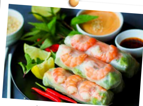
越南春卷 Spring Rolls