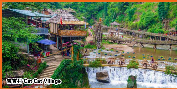
吉吉村 Cat Cat Village

沿台阶步行下山，前往赫蒙族聚居的吉吉村，参观当地人在梯田劳作的景象，欣赏法国殖民时期建造的水力发电站及附近的瀑布，适合稍作歇息。