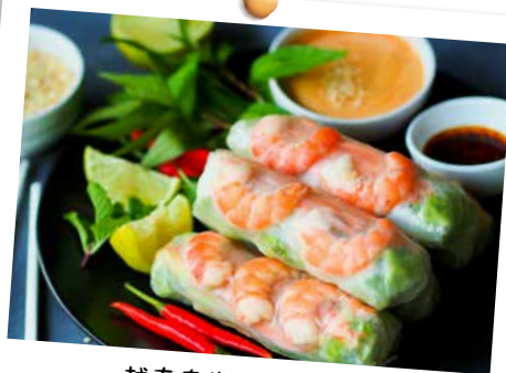
越南春卷 Spring Rolls