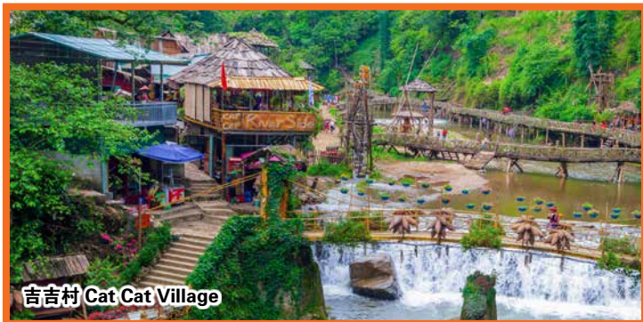
吉吉村 Cat Cat Village