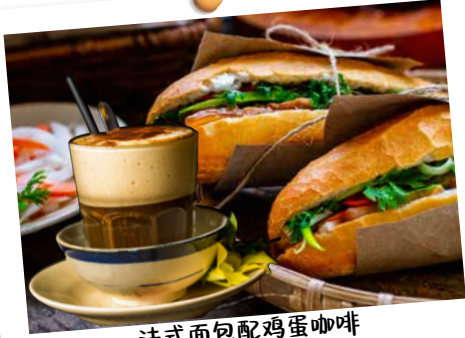
法式面包配鸡蛋咖啡 French bread + Egg Coffee