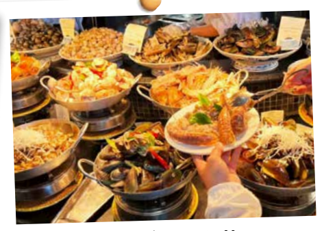
SEN 自助餐 SEN buffet