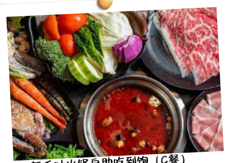
新千叶火锅自助吃到饱 (C餐) Steamboat Buffet