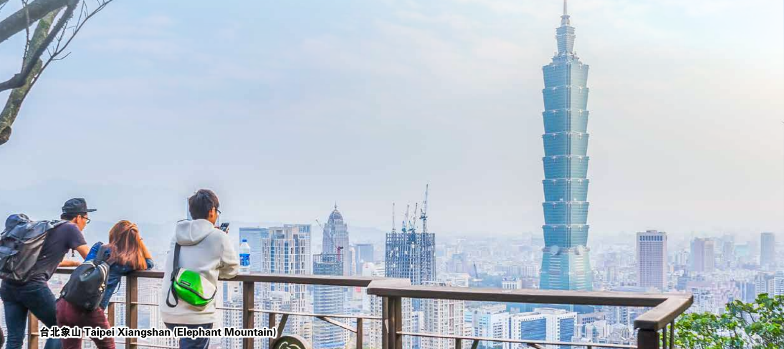
台北象山 Taipei Xiangshan (Elephant Mountain)