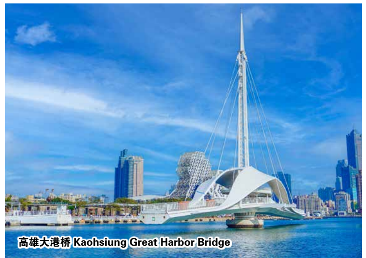
高雄大港桥 Kaohsiung Great Harbor Bridge