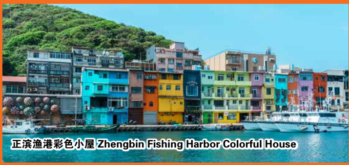
正滨渔港彩色小屋 Zhengbin Fishing Harbor Colorful House