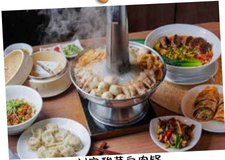
刘家酸菜白肉锅 Liu's Pickled Cabbage Hot Pot