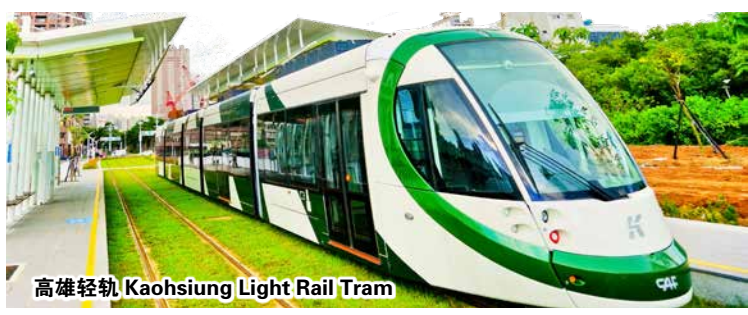
高雄轻轨 Kaohsiung Light Rail Tram