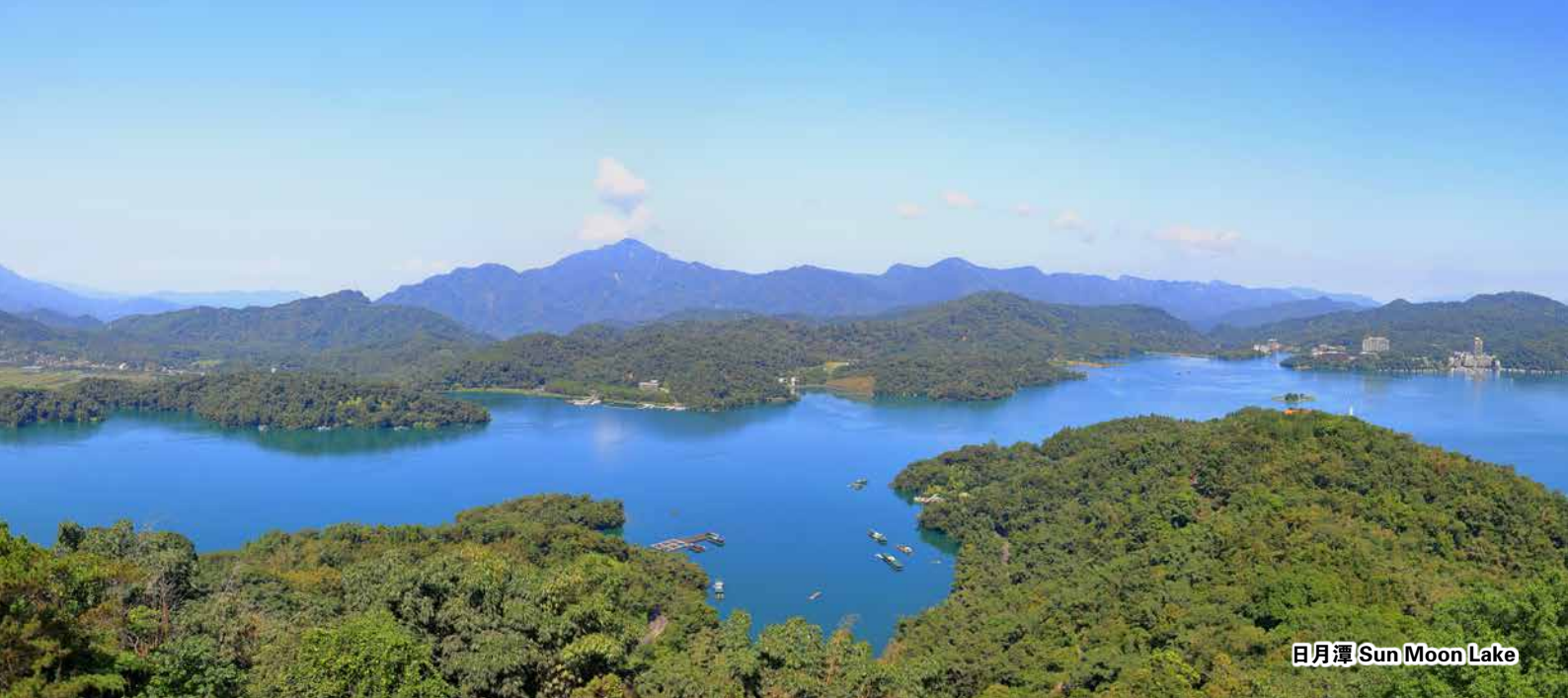
日月潭 Sun Moon Lake