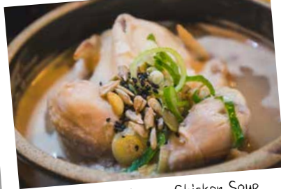
人参鸡汤 / Ginseng Chicken Soup