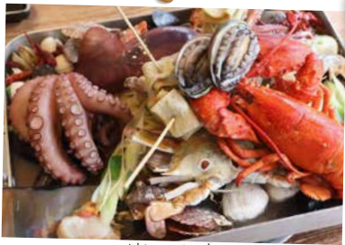
龙虾一只鸡 Lobster Seafood Steamboat