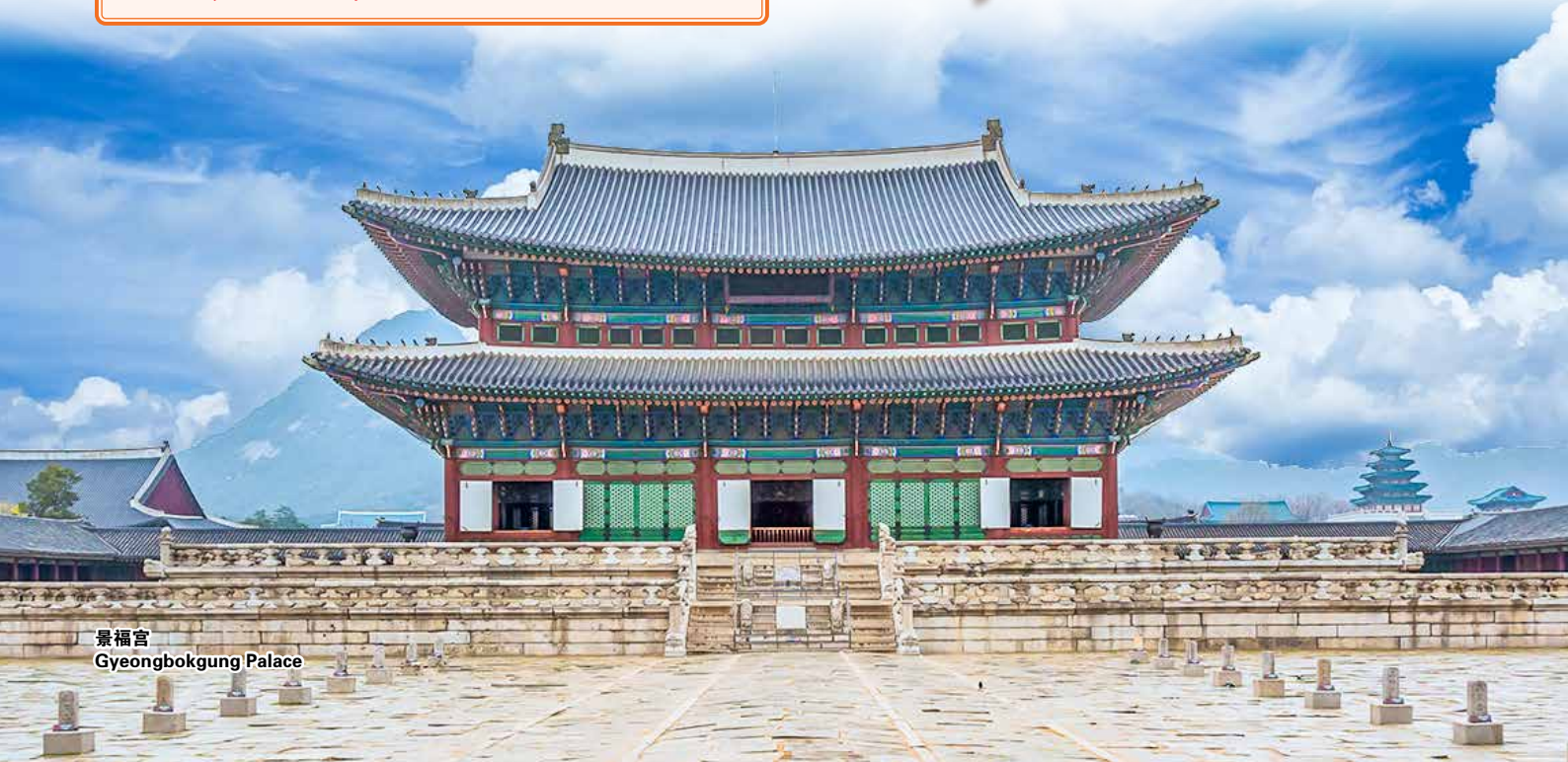
景福宮 Gyeongbokgung Palace