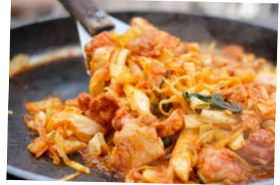
春川辣炒鸡 / Pan Fried Spicy Chicken