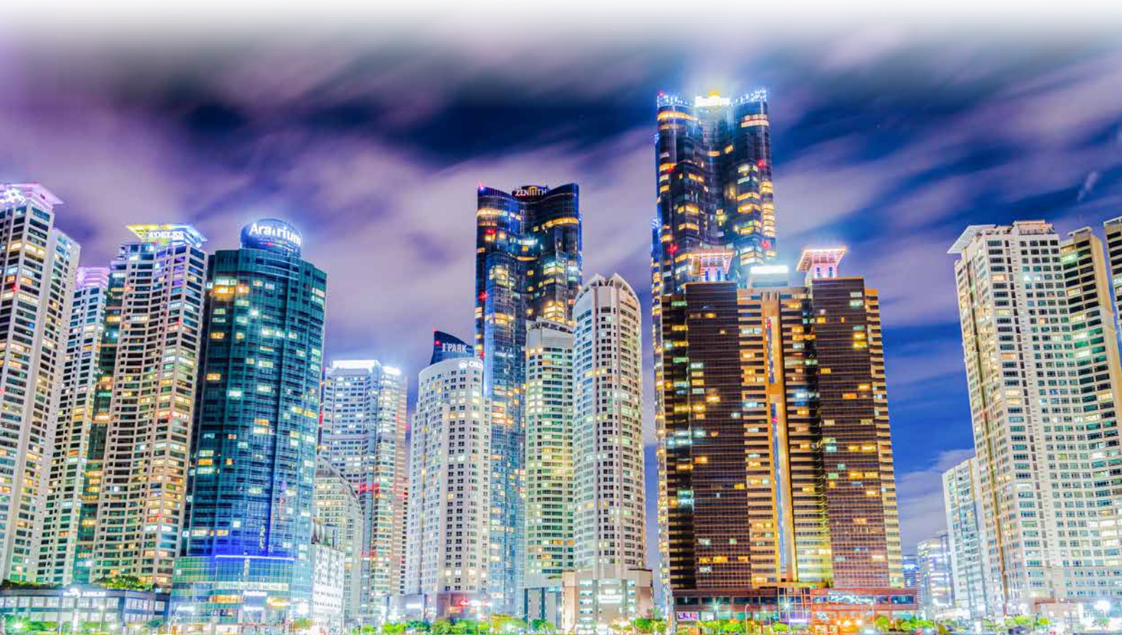
The Bay 101 夜景 The Bay 101 Night View