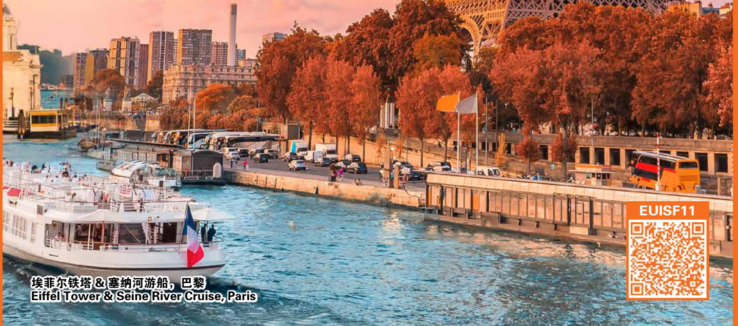
埃菲尔铁塔 & 塞纳河游船, 巴黎 Eiffel Tower & Seine River Cruise, Paris

罗马 | 比萨 | 佛罗伦萨 | 威尼斯 | 米兰 | 卢塞恩 | 南锡 | 巴黎 ROME | PISA | FLORENCE | VENICE | MILAN | LUCERNE | NANCY | PARIS