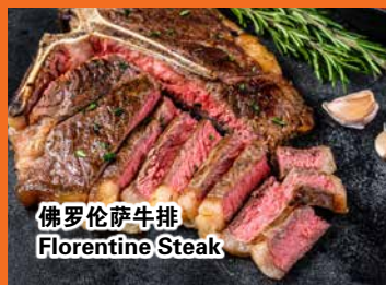
佛罗伦萨牛排 Florentine Steak