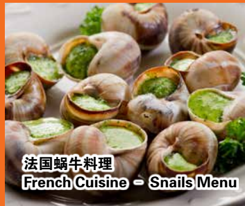
法国蜗牛料理 French Cuisine = Snails Menu