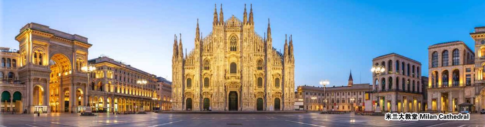
米兰大教堂 Milan Cathedral