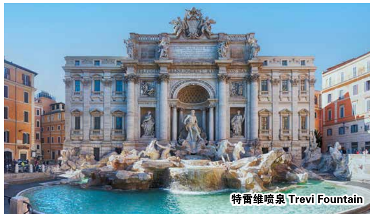
特雷维喷泉 Trevi Fountain