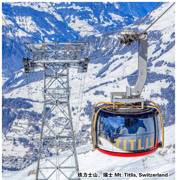
铁力士山，瑞士 Mt. Titlis, Switzerland