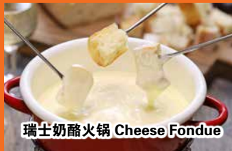
瑞士奶酪火锅 Cheese Fondue