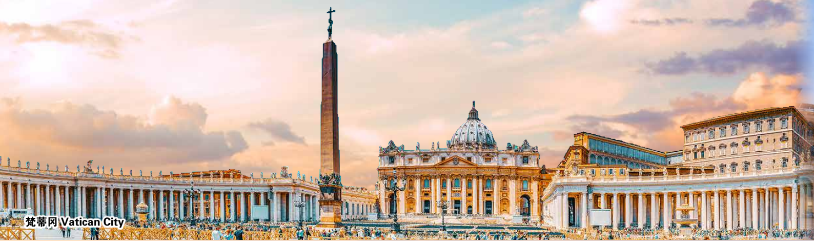
梵蒂冈 Vatican City