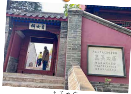
孟姜女庙 Meng Jiangnu Temple