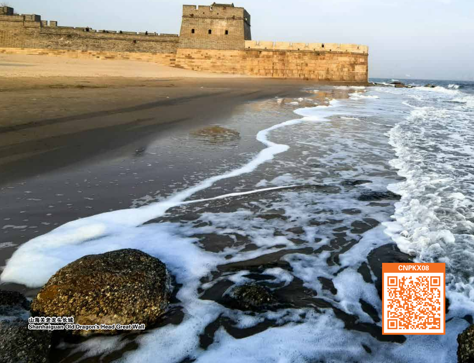
山海关龙头长城 Shanhaiguan Old Dragon's Head Great Wall

唐山 | 秦皇岛 | 天津 TANGSHAN | QINHUANGDAO | TIANJIN