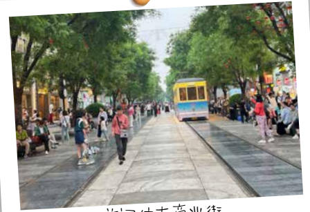
前门仿古商业街 Qianmen Pedestrian Street