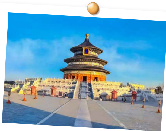
天坛 / Temple of Heaven