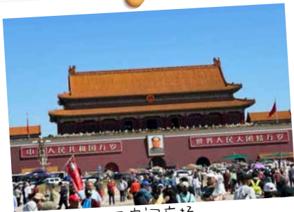
天安门广场 Tiananmen Square