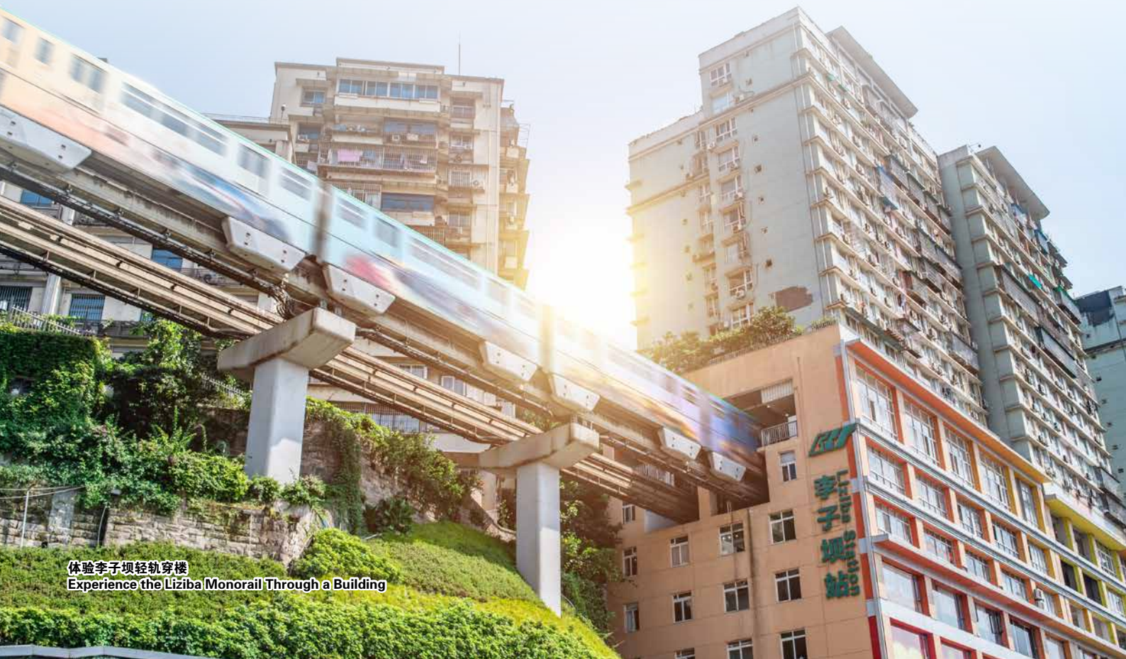
体验李子坝轻轨穿楼 Experience the Liziba Monorail Through a Building