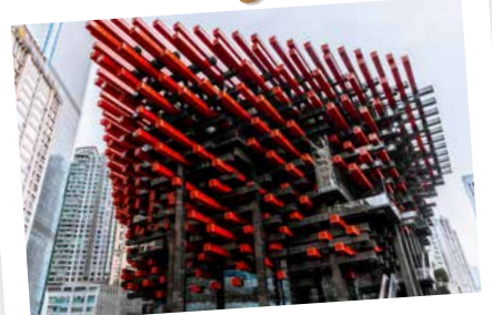
国泰艺术中心 Guotai Arts Center