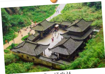
武隆天福宫驿 Wulong Tianfu Posthouse