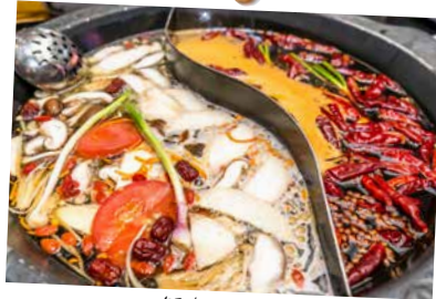
鸳鸯火锅 Yuanyang Hotpot